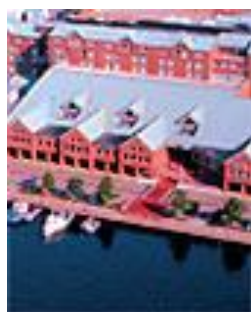
Marriott Newport, RI